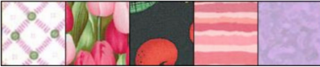
Plaid, floral BLACK, stripes, solid